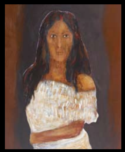
Señora de la Luna, 36" x 49" acrylic original and giclee edition of 100