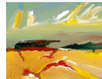
“Dragon View” 16" x 20"

A studio/gallery showing finished artworks and works in progress for the discerning collector. An eclectic range of work from light-filled landscapes to in-depth psychological/spirit-filled paintings of the human condition done in Victor Stevens-Rosenberg’s unique and individual style.